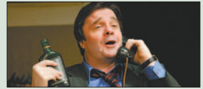
Nathan Lane in Butley

Butley (through 1/14); The Coast of Utopia, Part One: Voyage (through 3/11); Heartbreak House (through 12/10); Dr. Seuss' How the Grinch Stole Christmas! The Musical (through 1/7)